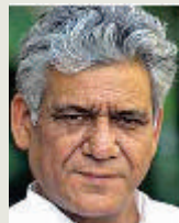
Padamshri OM PURI