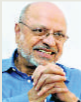
Padma Bhushan SHYAM BENEGAL